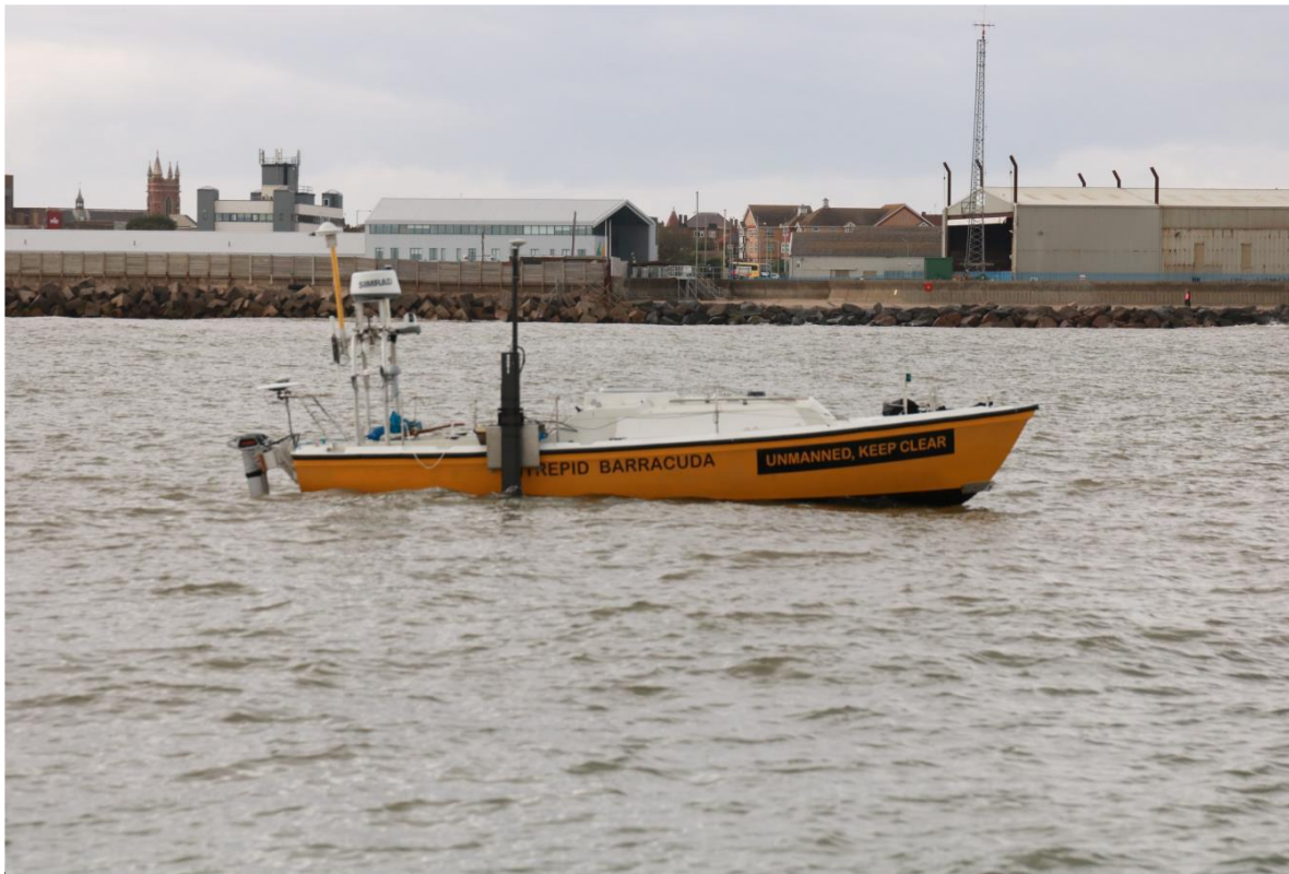
USV 'Intrepid Barracuda'

The USV name is 'Intrepid Barracuda' and will be remotely controlled by a USV 'Pilot'. The vessel is capable of working 24/7, it has AIS, Navigation lights, a radar reflector and has a yellow superstructure (see below photo).