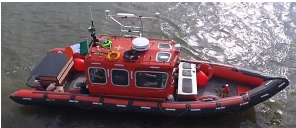
Figure 2- Spectrum Nyquist

Call sign MIIG4. MMSI 232031312. Vessels mobile No. +44 07803 031728.