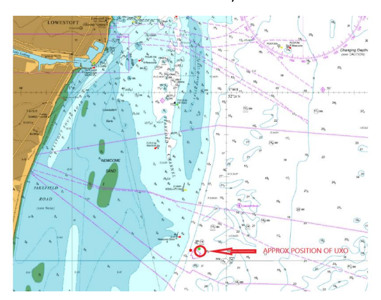
Chart extract BA1535 to indicate approx. position of UXO

This seabed obstruction presents a potential hazard to vessels engaged in fishing activity using trawl/bottom fishing gear, and to vessels using anchors in this area.