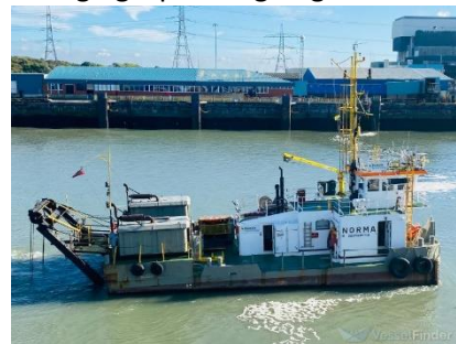
Survey vessel “ Porthos ”