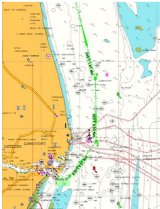
Figure 1- Transit to/from Survey Area

Mariners and Port Users are advised that an unmanned surface vessel (USV) will transit from the Port of Lowestoft on Monday 16 th August 2021 (subject to weather) and will be used for hydrographic survey works off the Norfolk Coast, and will proceed to/from the survey area via the route shown in figure 1 below.