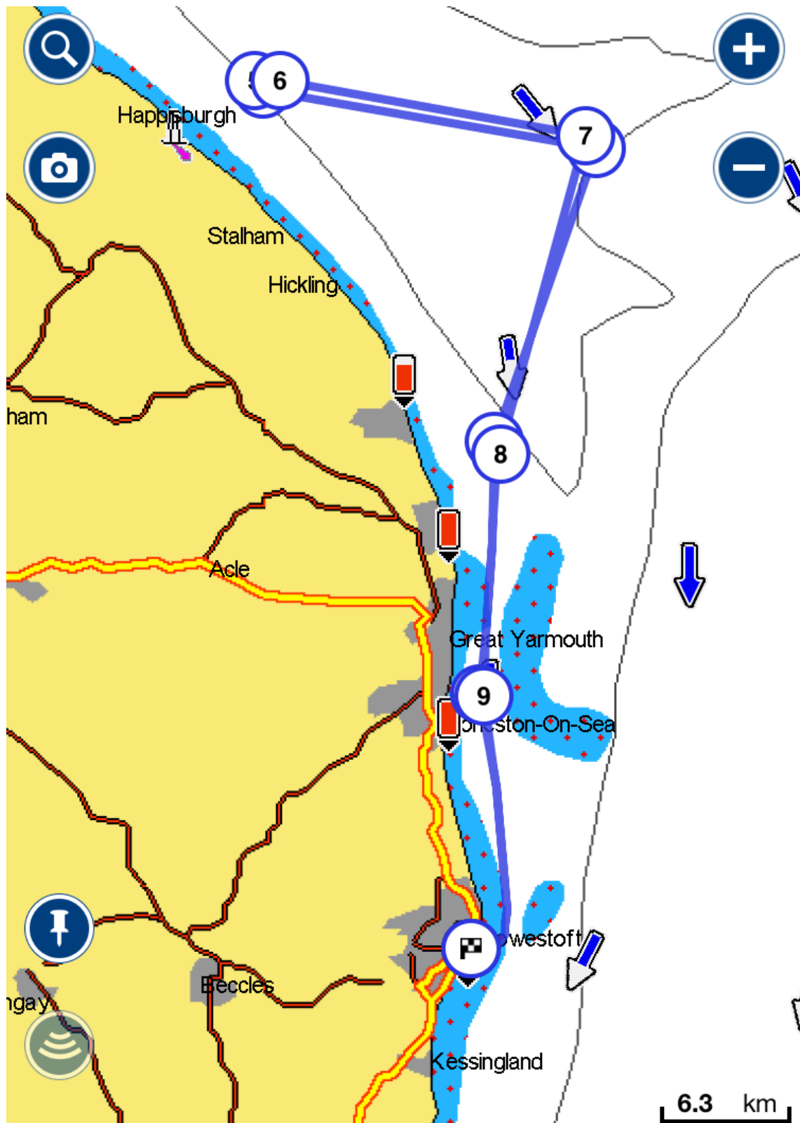
Route: North Route