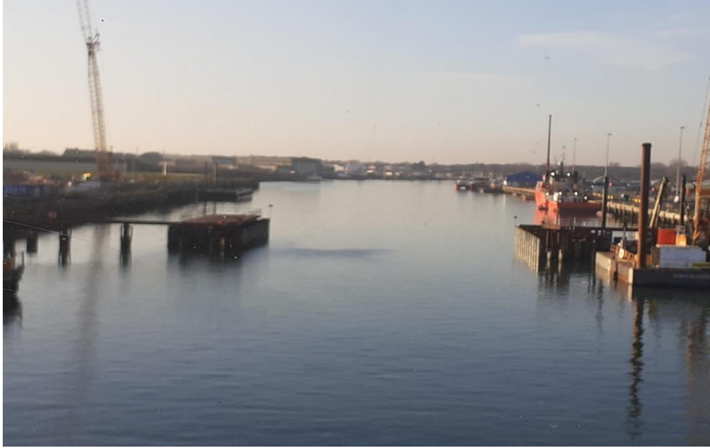
Gull Wing Construction Area from the East